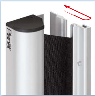
Easy clip-on system