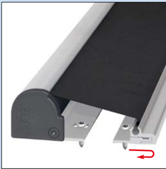
Side view, invisible screws