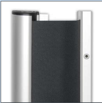
Standard, screw-fixed roller protector