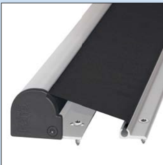
Screws partially hidden