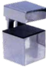
K-613 Glass Grip Support S, L Glass Thickness 5-15mm Brushed Satin Nickel