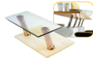
MK-544-F Console Table Stand (Slant) Chrome Plated Dia. 50mm x H200mm