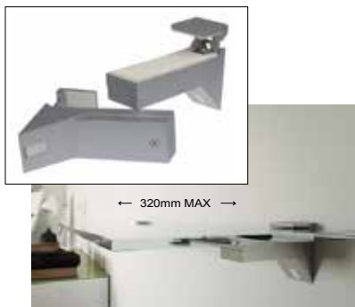
Italiana Kalabrone Maxi Glass Adjustable Shelf Support 8-30mm Shelf thickness Load capacity: 25kgs per pc (50kgs Per Shelf)

* (Shelf can be regulate after installed)