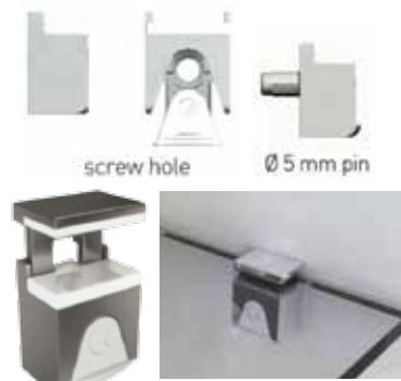
Italiana KUBIC Adjustable Glass Shelf Support Glass Thickness : 5 -9 mm