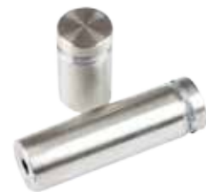
6090 a) \varnothing 19 \times 25 & 38 & 50 & 60 & 75 & 100 & 150 & 200mm b) \varnothing 12 \times 25 mm Glass Spacer Brushed Satin Nickel, Chrome