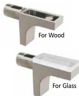
Italiana K LINE Glass Shelf Support Dia. 5mm Pin L: 23.5mm X W: 6mm

* (Shelf can be regulate after installed)