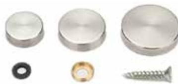
CM-016 Mirror Screw Cap Glass Spacer Brushed Satin Nickel, Dia. 12mm, 14mm, 16mm, 20mm