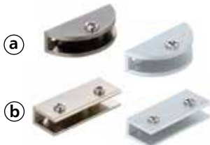
a) MI-5024 Glass Holder Glass Thickness : 8-12mm