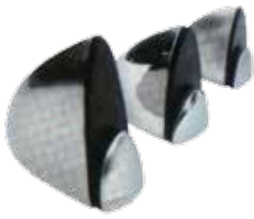
ST-1411 Holder L/M/S Glass Thickness 5-15mm Brushed Satin Nickel