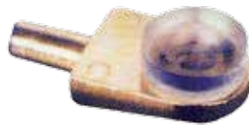
SS-107 L: 26 X W: 12mm Glass Stud Dia. 5mm Pin Nickel